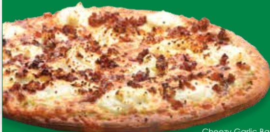
Cheezy Garlic Bacon

*Our gluten free crust is prepared in an area where products with gluten are also prepared. We urge people with severe allergies to use caution as the complete absence of gluten and other allergens cannot be guaranteed.