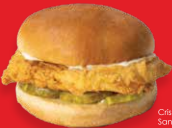
Crispy Chicken Sandwich