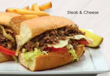
Steak & Cheese