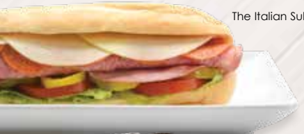
The Italian Sub